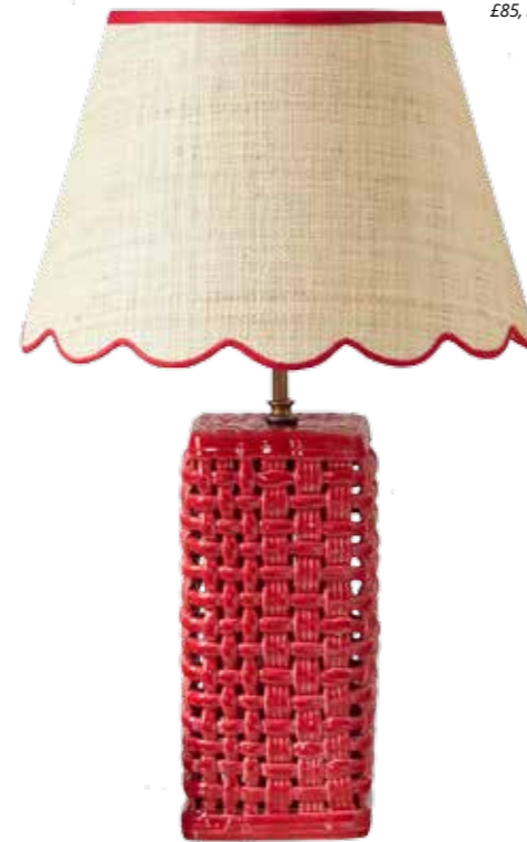
Raffia scallop lampshade £185, matildagoad.com