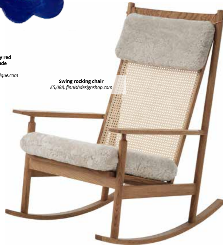
Swing rocking chair £5,088, finnishdesignshop.com