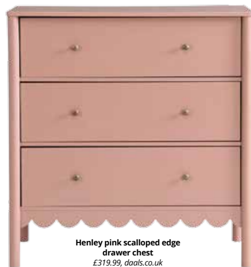
Henley pink scalloped edge drawer chest £319.99, daals.co.uk