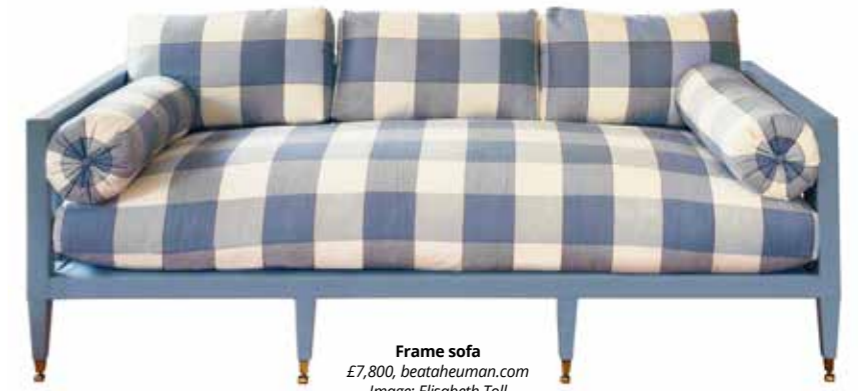
Frame sofa £7,800, beataheuman.com Image: Elisabeth Toll