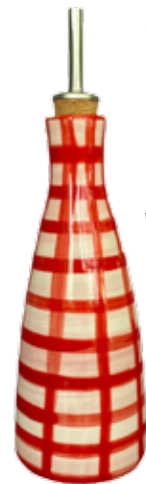
Oily baby red and nude £65, vaisselleboutique.com