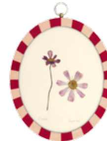
Oval lacquered frame with pressed cosmos £180, matildagoad.com