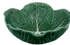
Cabbage bowls £18, birdiefortescue.co.uk