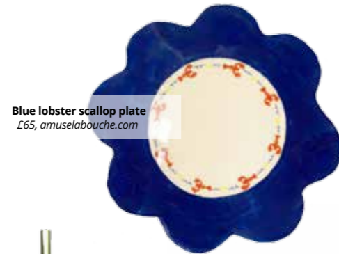
Blue lobster scallop plate £65, amuselabouche.com

Last year, the cottagecore aesthetic really captured people's imaginations. The ever-increasing pace of modern life had us harking back to a simpler time, perhaps, and our homes became places where we could escape into our nostalgic interior lives. The trend, however, does pose the risk of running from the quaint into the stuffy. That's why, this year, cottagecore is looking away from the English Arcadia of the Thomas Hardy era, and towards Scandinavia. In Copenhagen and Oslo, interiors are minimal; but head to the Stockholm archipelago, or forests of Finland, and you'll find a different sort of hygge . Still eminently cool, don't get us wrong – nothing else would do from our Nordic friends – but cute. Kitsch, even. More scalloped edges than dust ruffles; wobbly ceramics over Waterford crystal. It can be difficult to put the 'Scandinavian' into 'Scandinavian cottagecore'. But never fear. We've put together an edit of pieces that toe the line between cosy and cool – you know, less grandma, more Gothenburg.