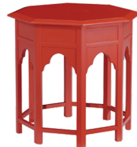
Tangina rouge side table £1,790, decoralist.com