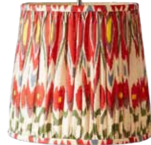
Tapered pendant shade £70, pooky.com