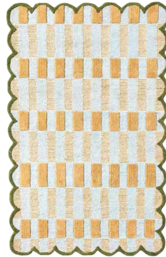
Tufted plaid rug £998, anthropologie.com