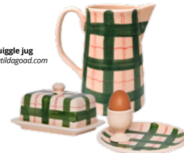
Squiggle jug £85, matildagoad.com