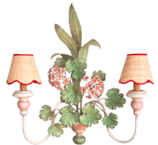
Raffia scallop candle shade £80, matildagoad.com