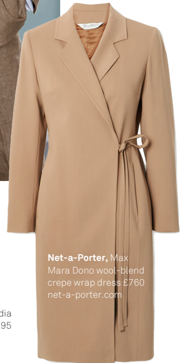
Net-a-Porter , Max Mara Dono wool-blend crepe wrap dress £760 net-a-porter.com