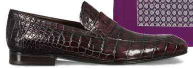
Berluti , Carlo Como alligator leather loafer £7,650 berluti.com