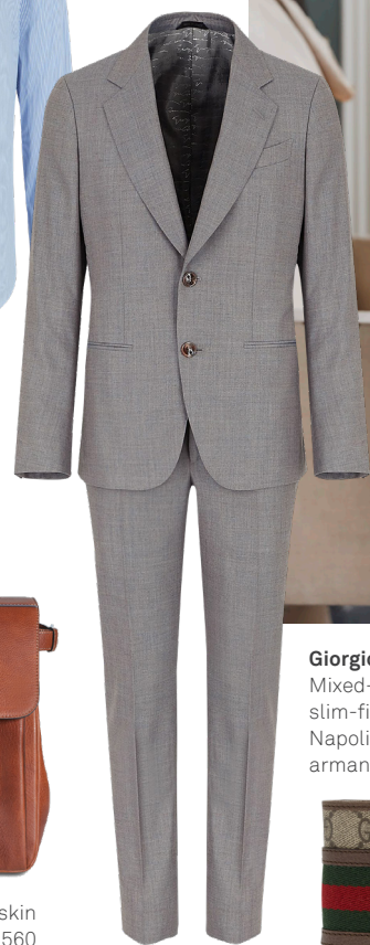
Giorgio Armani , Mixed-wool, full-canvas, slim-fit suit from the Napoli line £2,300 armani.com