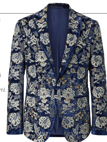
Mr Porter , Etro slim-fit embellished velvet tuxedo jacket £4,330 mrporter.com