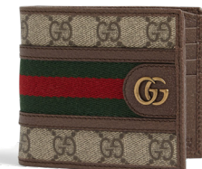
Selfridges , Gucci Ophidia canvas bifold wallet £295 selfridges.com