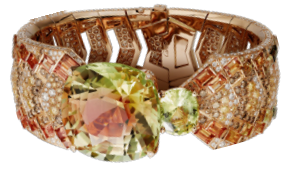
Cartier , Rose gold, tourmaline, yellow green sapphire, sapphires, diamonds POA cartier.com