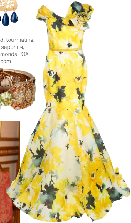
Marchesa , Floral print fit-to-flare gown £4,033 marchesa.com