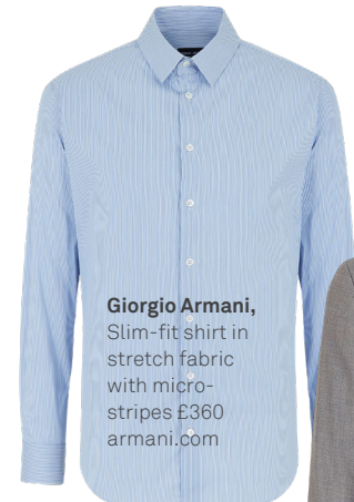
Giorgio Armani , Slim-fit shirt in stretch fabric with micro-stripes £360 armani.com

Working at home wasn't without benefits. But it's high time for a return to midtown meetings, breakfast briefings and power lunches. To look the part, there are sharp suits courtesy of Giorgio Armani, chic Gucci co-ords, and gleaming leather briefcases from Brunello Cucinelli