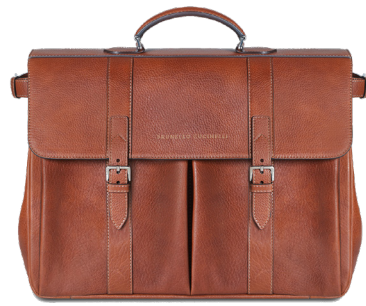
Brunello Cucinelli , Grained calfskin briefcase in rum £2,560 brunellocucinelli.com