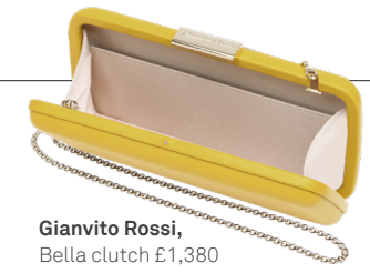
Gianvito Rossi , Bella clutch £1,380 gianvitorossi.com