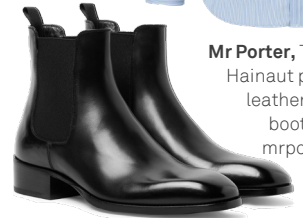
Mr Porter , Tom Ford Hainaut polished-leather Chelsea boots £1,550 mrporter.com