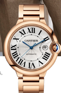
Cartier , Ballon bleu de Cartier watch £29,200 cartier.com