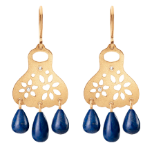
Ole Lynggaard , Lace earrings in gold with lapis lazuli and pavé £10,720 olelynggaard.com