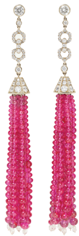
Net-a-Porter, Fred Leighton Collection 18-karat white gold, ruby and diamond earrings £30,645 net-a-porter.com