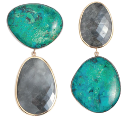
Melissa Joy Manning, Grey quartz and chrysocolla mismatched drop earrings £1,638.46* melissajoymanning.com