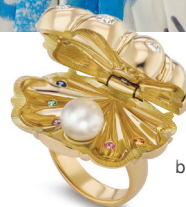
Brent Neale, Large clam shell ring £10,920* brentneale.com