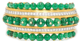
Fred Leighton, Yellow gold emerald bead and diamond cuff by Suzanne Belperron £287,640* fredleighton.com