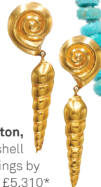
Fred Leighton, 18k yellow gold seashell pendant earrings by Lalaounis £5,310* fredleighton.com