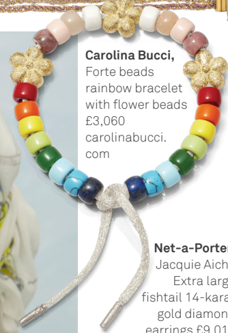
Carolina Buccu, Forte beads rainbow bracelet with flower beads £3,060 carolinabuccu. com