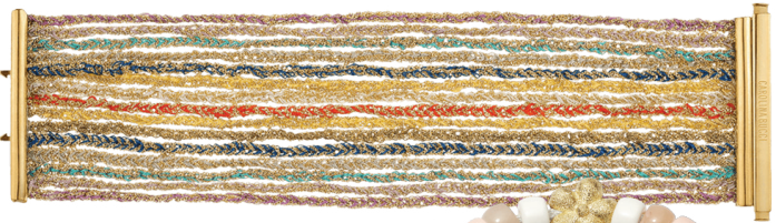
Carolina Buccu, 15 strand lazy lucky bracelet £8,990 carolinabuccu.com