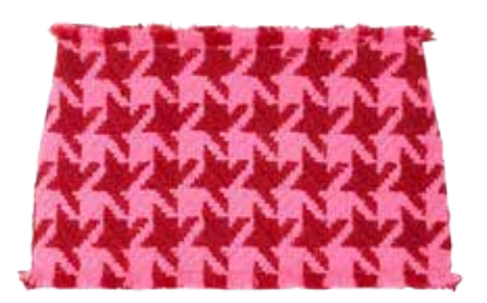
FRAYED TWEED MINI SKIRT The micro-mini is out. Introducing: the nano-mini. In fuschia dogtooth, if possible.