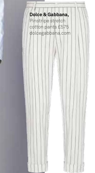
Dolce & Gabbana , Pinstripe stretch cotton pants £575 dolcegabbana.com