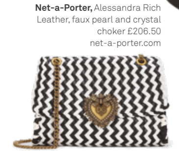
Dolce & Gabbana , Large devotion shoulder bag in woven nappa leather £2,850 dolcegabbana.com