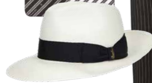
Borsalino , Fidel large brim panama £410 borsalino.com