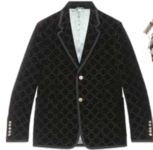
Gucci , GG velvet jacket £2,230 gucci.com