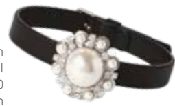
Net-a-Porter , Alessandra Rich Leather, faux pearl and crystal choker £206.50 net-a-porter.com