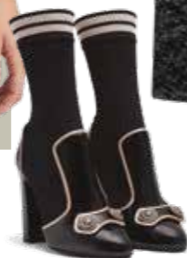
Dolce & Gabbana , Polished calfskin ankle boots with knit sock detail £925 dolcegabbana.com