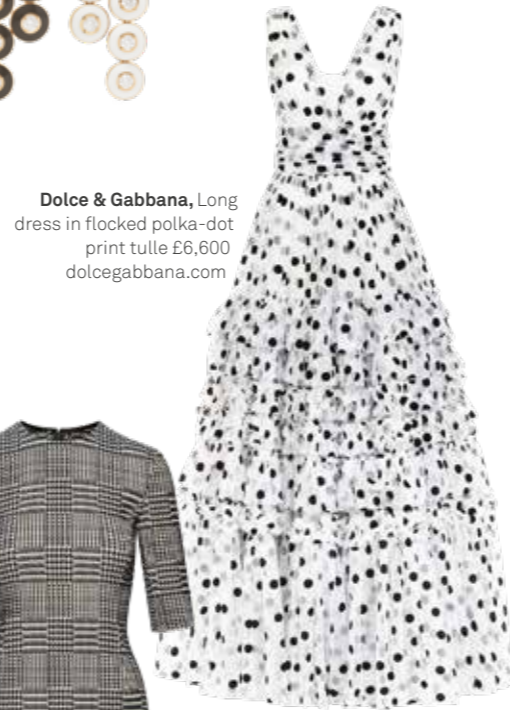
Dolce & Gabbana , Long dress in flocked polka-dot print tulle £6,600 dolcegabbana.com