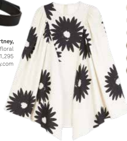
Stella McCartney , Luciana floral dress £1,295 stellamccartney.com