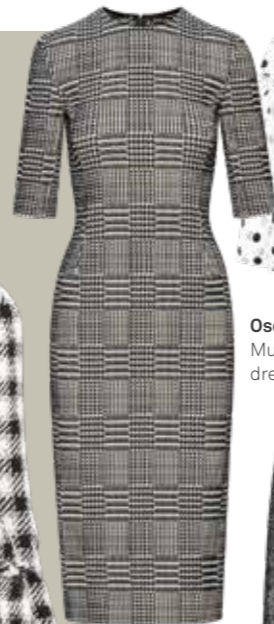
Oscar de la Renta , Multi-check Jacquard dress £1,194.58