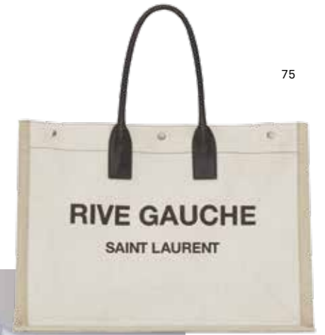
Saint Laurent , Rive Gauche tote bag in linen and leather £945 ysl.com