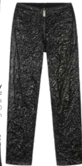
Givenchy , Crackled painted jeans £780 givenchy.com