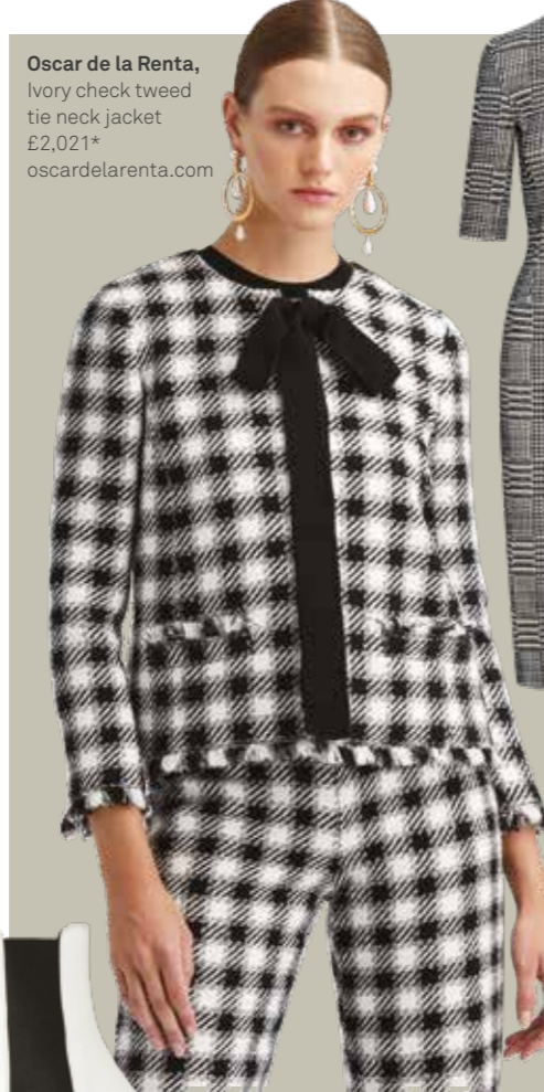
Oscar de la Renta , Ivory check tweed tie neck jacket £2,021* oscardelarenta.com

Once upon a time summer fashion meant bright colours, but this season is all about monochrome. During SS21 shows, Chanel opted for crisp layering in black and white, while Gabriela Hearst showcased achromatic eveningwear. Balmain's colourless power suit made a statement, as did Dolce & Gabbana's Sixties minidress in checkerboard hues.