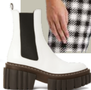
Stella McCartney , Emilie boots £695 stellamccartney.com