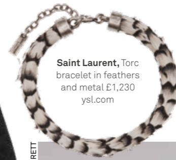
Saint Laurent , Torc bracelet in feathers and metal £1,230 ysl.com