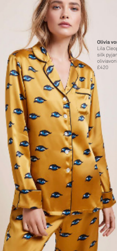
Olivia von Halle Lila Cleopatra silk pyjama oliviavonhalle.com, £420