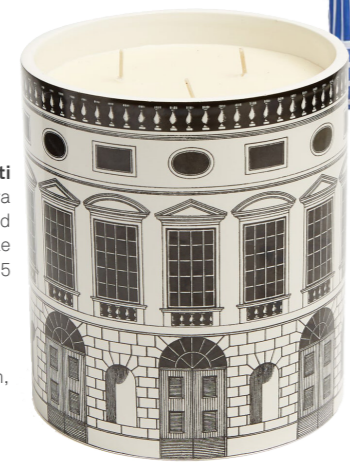
Fornasetti Architettura Otto-scented triple-wick candle fornasetti.com, £495