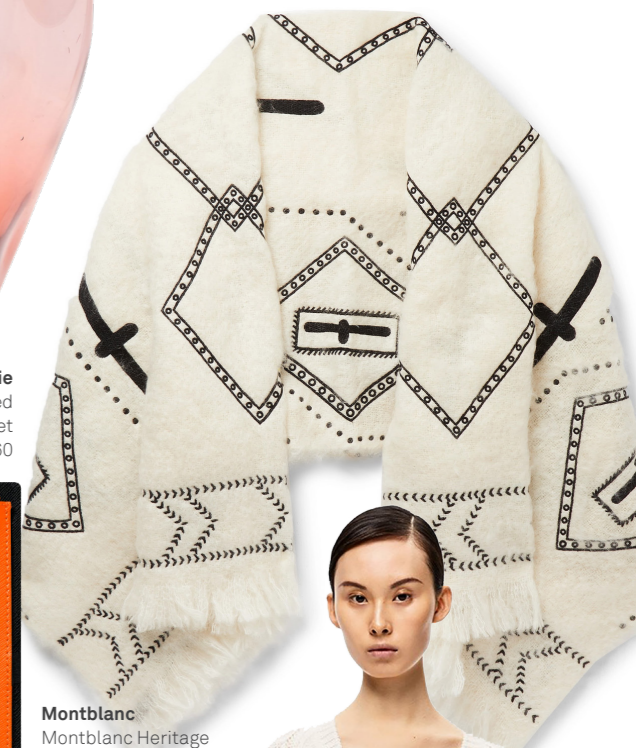
Jupe by Jackie Awamu Fringed Embroidered Mohair Blanket netaporter.com, £2,160