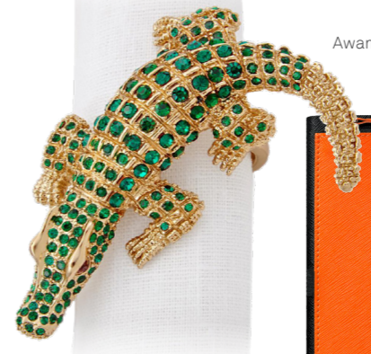
L'Objet Set Of 4 Gold Crocodile Napkin Rings luxdeco.com, £200