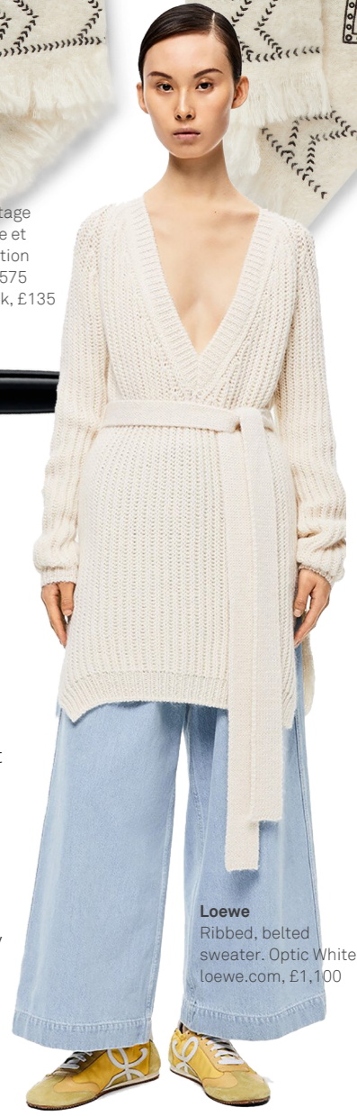
Loewe Ribbed, belted sweater. Optic White loewe.com, £1,100