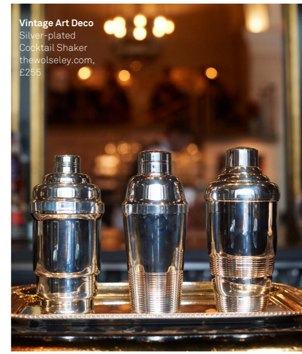
Vintage Art Deco Silver-plated Cocktail Shaker thewolseley.com, £255

AH, THE GREAT indoors. Rather than flitting from a Tuscan terrazza to a house in the Hamptons this spring and summer, many of us are splitting our time between the lounge, the kitchen and the garden instead.