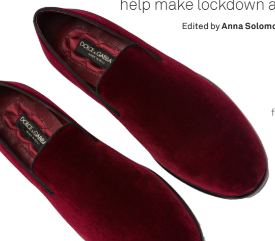
Dolce & Gabbana Velvet slippers dolcegabbana.com, £475