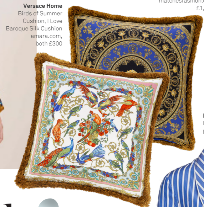
Versace Home Birds of Summer Cushion, I Love Baroque Silk Cushion amara.com, both £300