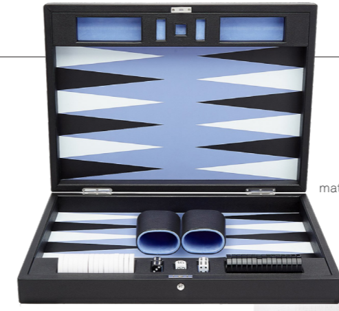
Grosvenor Large backgammon set smythson.com, £2,995