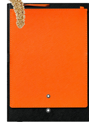
Montblanc Montblanc Heritage Collection Rouge et Noir Special Edition Fountain Pen, £575 Orange notebook, £135 montblanc.com