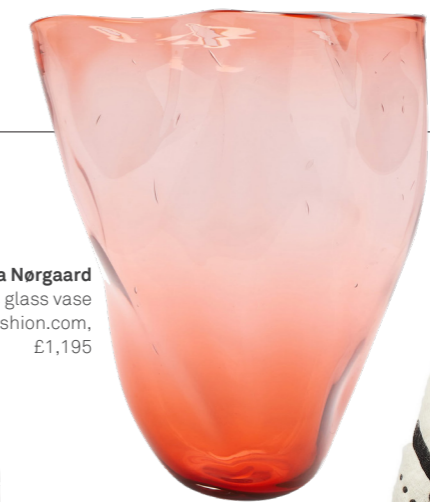
Nina Nørgaard Récifs glass vase matchesfashion.com, £1,195