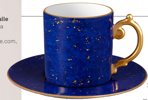
L'Objet Lapis Espresso Cup & Saucer l-objet.com, £77