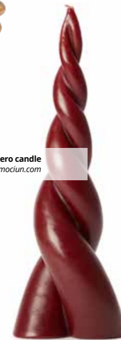
Duplero candle £26, mociun.com