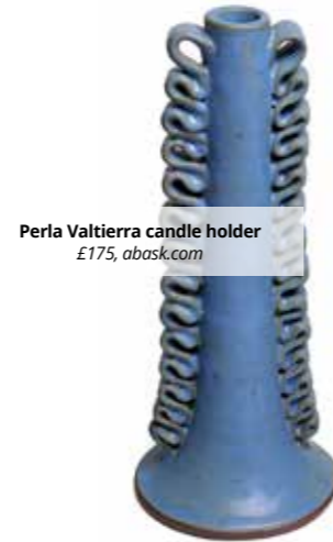
Perla Valtierra candle holder £175, abask.com