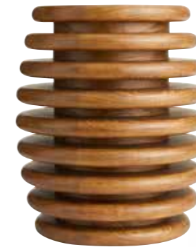
Lenny side table £750, sohohome.com