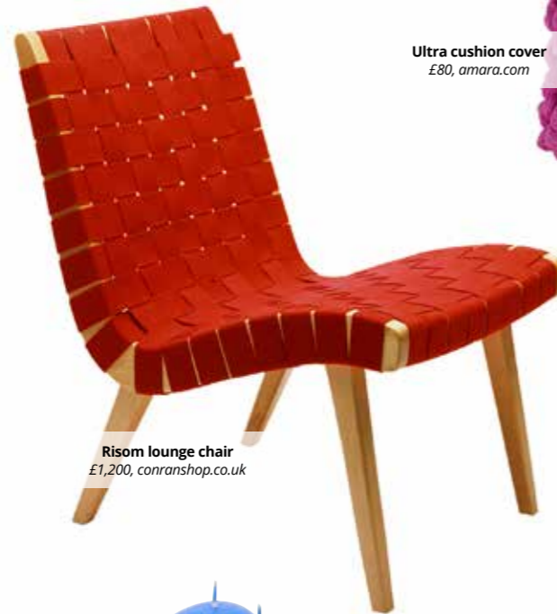
Risom lounge chair £1,200, conranshop.co.uk