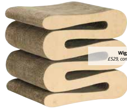
Wiggle stool £529, conranshop.co.uk

So here's to fluffy throws, fuzzy poufs and knobbly tableware. To objects that intrigue and have fun, and to spaces that are one oddly-shaped cushion away from feeling like an adult's soft play area. Because who really wants to feel like they're living in a high-end spa? This is a lot more fun.