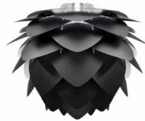
Umage Silvia shade £88, amara.com