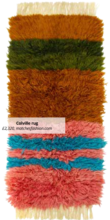
Colville rug £2,320, matchesfashion.com