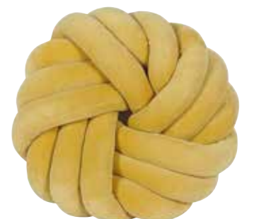
Knot cushion £30.99, belliani.co.uk