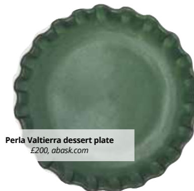
Perla Valtierra dessert plate £200, abask.com