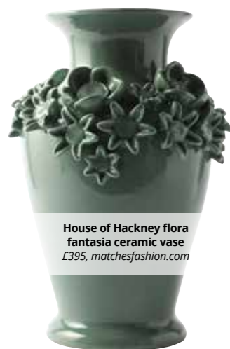
House of Hackney flora fantasia ceramic vase £395, matchesfashion.com