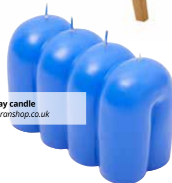
Orsay candle £29, conranshop.co.uk