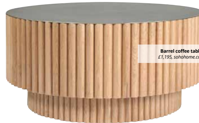
Barrel coffee table £1,195, sohohome.com