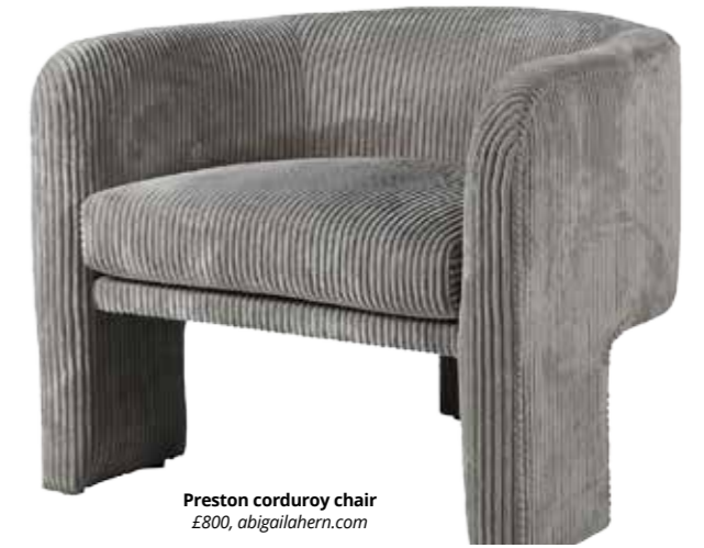
Preston corduroy chair £800, abigailahern.com