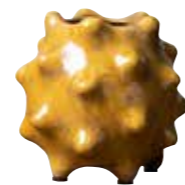
Otterley vase £15, abigailahern.com