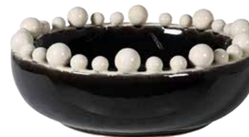
Bourton bowl £75, abigailahern.com