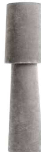
Laffin lamp £280, abigailahern.com