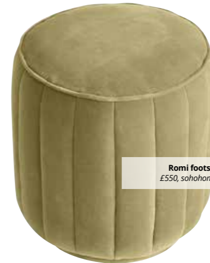
Romi footstool £550, sohohome.com