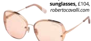
Square snake sunglasses, £104, robertocavalli.com