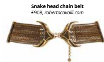
Snake head chain belt £908, robertocavalli.com