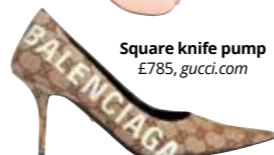
Square knife pump £785, gucci.com