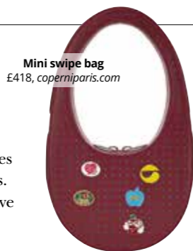
Mini swipe bag £418, coperniparis.com

From head (bandanas, tinted sunglasses) to toe (wedges and anything with a monogram – thanks Paris Hilton) and everything in between, accessories were everything in the noughties. Ideally, you'd wear all of the above in one outfit. What can we say? More was more.