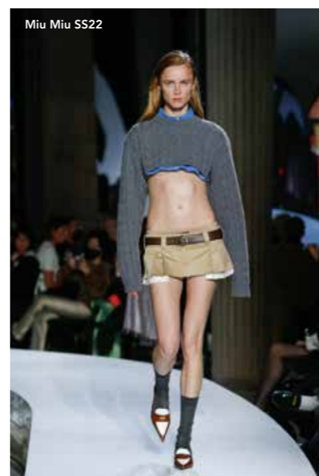
Miu Miu SS22