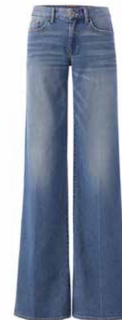
Right Rigid low-rise jeans, £510, modaoperandi.com Below Carter pleated mini skirt, £340, net-a-porter.com

The news of a 2000s resurgence struck fear into the hearts of many due to this most unflattering of trends. Who actually thought that putting a waistband below your stomach and hips was a good idea? We certainly didn't sign it off. Miu Miu and Missoni officially confirmed the return of this cursed craze in their SS22 shows.