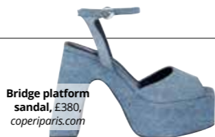
Bridge platform sandal, £380, coperniparis.com