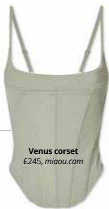
Venus corset £245, miaou.com