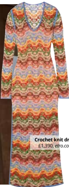
Crochet knit dress £1,390, etro.com