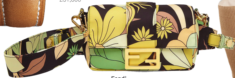
Fendi Baguette belt with flap and FF magnetic clasp fendi.com, £1,550