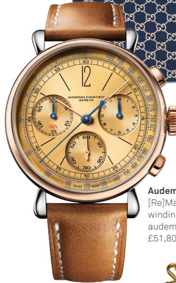
Audemars Piguet [Re]Master01 self- winding chronograph audemarspiguet.com, £51,800