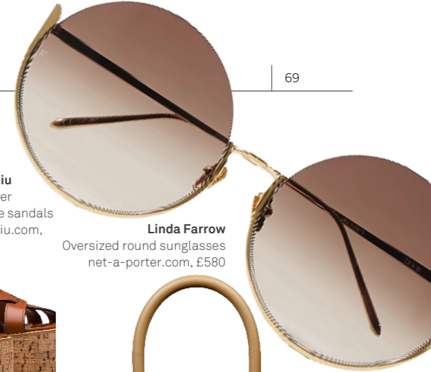
Linda Farrow Oversized round sunglasses net-a-porter.com, £580