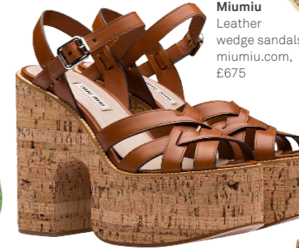
Miumiu Leather wedge sandals miumiu.com, £675