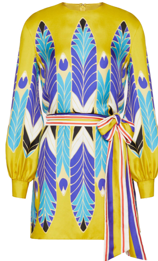
Valentino Yellow multicolour printed twill dress valentino.com, £1,290