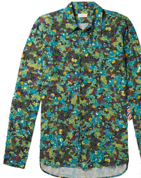
Dries van Noten Printed, sequin embellished shirt mporter.com, £620