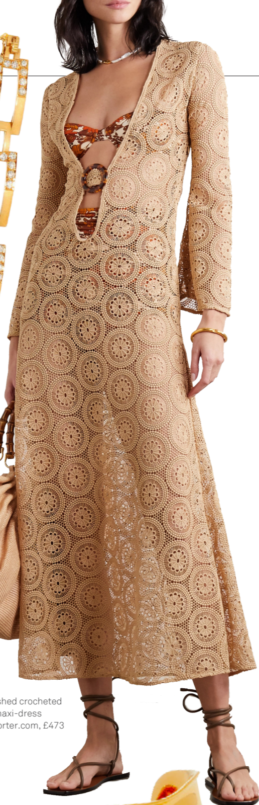
Jane Embellished crocheted cotton maxi-dress net-a-porter.com, £473