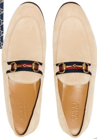
Gucci Stretch cotton polo-shirt gucci.com, £665