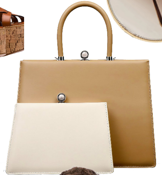
Ratio et Motus Twin frame biscuit and ivory bags ratioetmotus.com, $1,495

It's heating up, as everyone from Gucci to Saint Laurent channels the