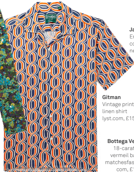
Gitman Vintage printed linen shirt lyst.com, £154