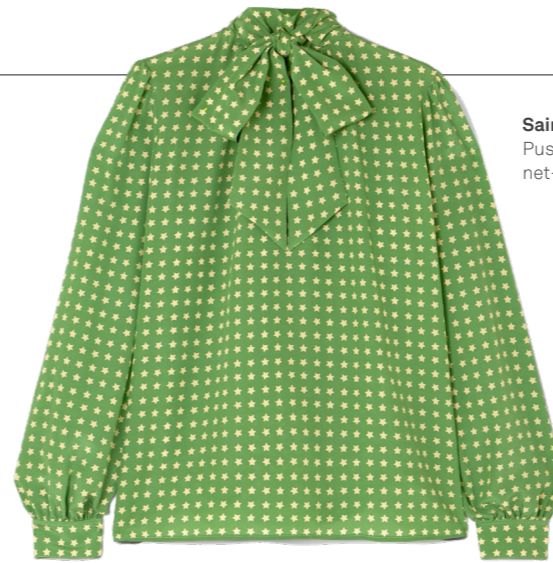
Saint Laurent Pussy bow, printed silk blouse net-a-porter.com, £1,110