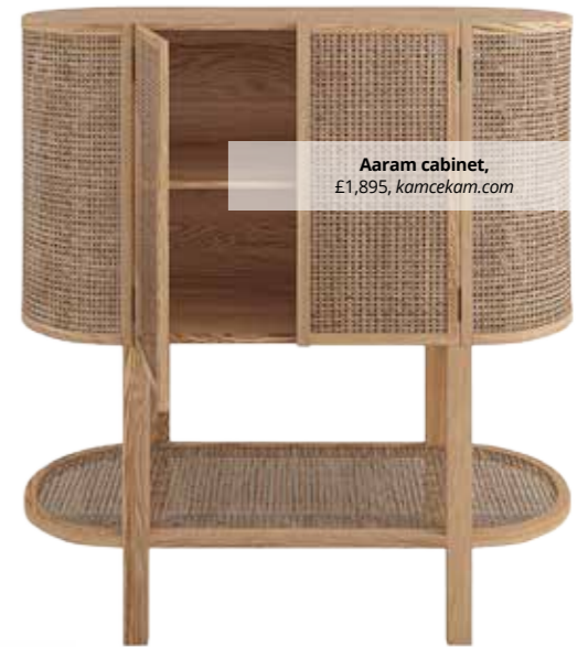
Aaram cabinet, £1,895, kamcekam.com