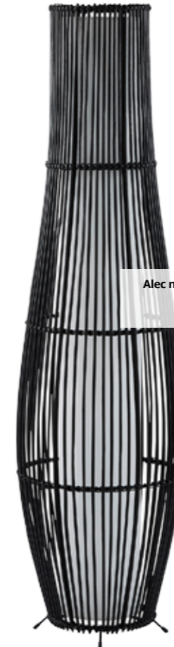
Alec natural cane floor lamp, £55, dunelm.com