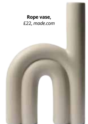
Rope vase, £22, made.com