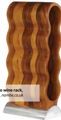
Curvo wine rack, £150, nambe.co.uk