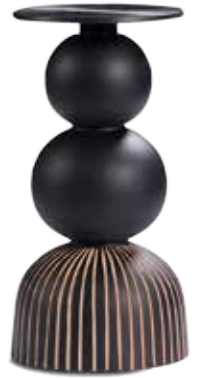
Zanat aurora candleholder, £119, farfetch.com