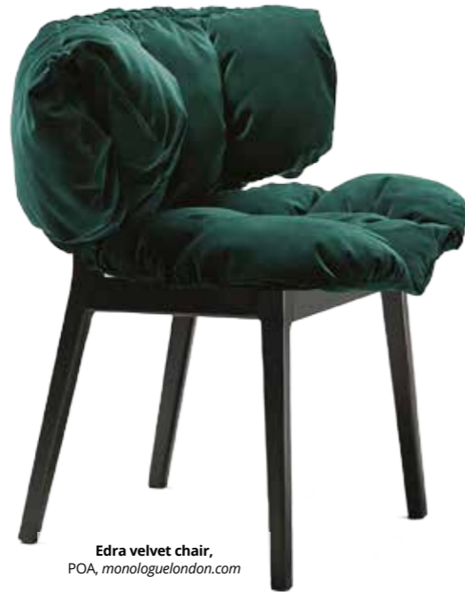
Edra velvet chair, POA, monologuelondon.com