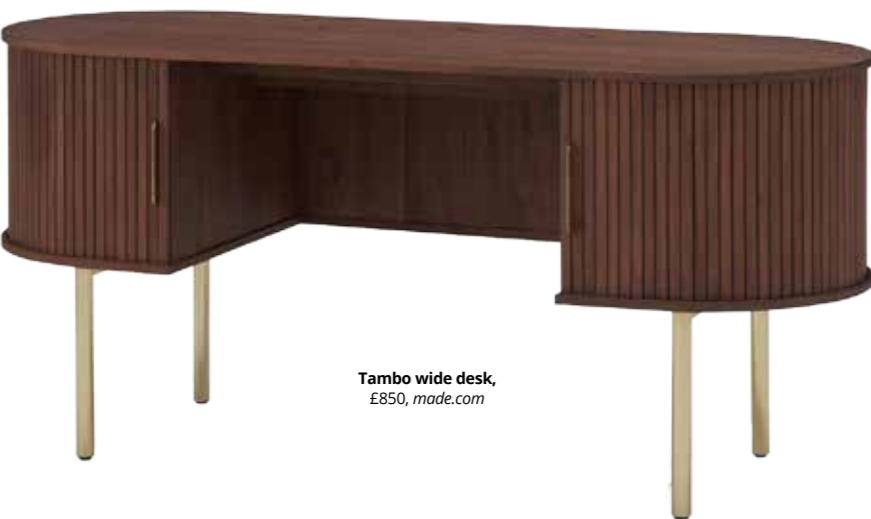
Tambo wide desk, £850, made.com

If you're plugged into the world of interiors, chances are you've heard of biophilia – the trend influenced by humanity's 'tendency to focus on lifelike processes'. Well, this isn't quite that, but it is similar. Biophilia usually refers to the presence of plants – but organic shapes and earthy tones can have just as calming an effect. In 2022, we're rejecting crisp lines and severe edges. Everything has gotten softer: corners are rounded, ceramics are artisanal, and metals are distressed. Natural-feeling textiles like boucle and wicker are coming to the fore, and when we can't have wooden tones, it's got to be moss green or rust orange.