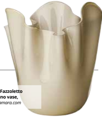
Venini Fazzoletto opalino vase, £822, amara.com