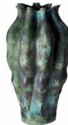
Cenote vase, £305, uk-fobjet.com