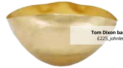
Tom Dixon bash vessel, £225, johnlewis.com