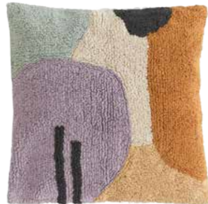
Tufted cotton cushion cover, £24.99, hm.com